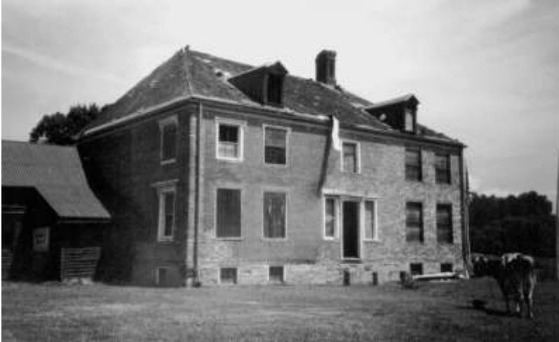
July 1995 - Scaghticoke, NY World Famous Knickerbocker Petting Zoo Famous KNICKole the COW looks at old house